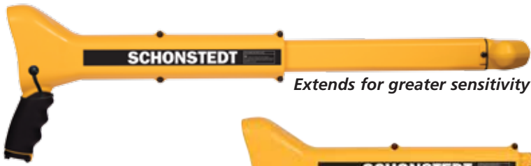
Extends for greater sensitivity