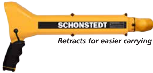
Retracts for easier carrying